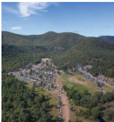
Tuff Truck "hidden valley" from the air.

After some camp supper or a bite from the onsite catering options, everybody encircles the Mudrats Revenge, a man-made mudpit full of challenging bolder piles, fallen telegraph poles and enormous speed humps shaped from the huge tyres off mining trucks. With only 8 minutes on the clock, teams have to keep momentum to make it to the finish line and score full points - only a small few ever do.